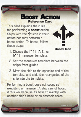
BOOST ACTION Reference Card This card explains the rules for performing a soosr action. Ships with the 4" cloin in their abouts action; portions in the 4" cloin in their abouts action; portions in 1. Choose the [11], [11], or If 11 maneuver template. 2. Set the maneuver template between the ship's front guides. 3. Move the ship to the opposite and of the template and side the rear guides of the ship into the template. Performing a boost does not count as executing a maneuver. A ship cannot boost if this would cause its base to overlay with enother ship's base or an obstacle token, or if the maneuver template overlaps an obstacle token.

"A ship cannot boost if this would cause its base to overlap with another ship's base or an obstacle token, or if the maneuver template overlaps an obstacle token."